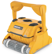
362128 WAVE 100 ROBOTIC POOL CLEANER