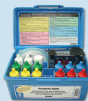
Taylor Test Kit 362014