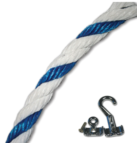
Pool Rope ▶ Polypropylene ▶ Blue/White high visibility ▶ Sold by the foot 362037 1/2" 362038 3/4" 362027 1/2" Pool Rope Hook 362028 3/4" Pool Rope Hook