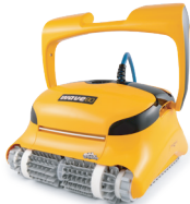
362127 WAVE 80 ROBOTIC POOL CLEANER