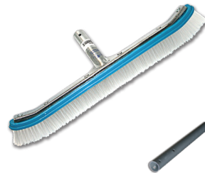
362064 18" Floor & Wall Pool Brush ▶ 18" Wide ▶ 1-1/4" nylon bristles ▶ Attaches to standard pool pole

Don't Forget! 362051 12' Straight Pool Pole 362052 16' Straight Pool Pole