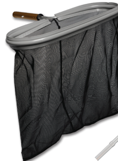
362046 Pool Leaf Rake ▶ Fiberglass net ▶ Clips onto 1-1/4" pole ▶ Solid tubular frame ▶ 18" long x 7" wide opening Don't Forget! 362053 8' - 16' Telescopic Pool Pole

Don't Forget! 362051 12' Straight Pool Pole 362052 16' Straight Pool Pole