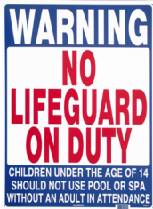
422021 Warning No Lifeguard On Duty Sign ▶ 18" x 24" ▶ Plastic ▶ [Warning text is 4" to comply with DHS 172.23]