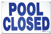
422019 Swimming Pool Closed Sign ▶ 12" X 18"