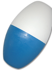
362039 Plastic Pool Rope Float ▶ Blue & White plastic rope float ▶ 3/4" Hole ▶ 5" x 9"