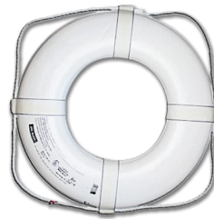
362034 24" Coast Guard Approved Life Ring ▶ Vinyl coated foam ring ▶ Attached rope for grasping ▶ UL listed