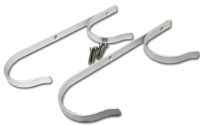
362049 Aluminum Pole & Hose Hanger Set ▶ Hangers for pool hoses and poles ▶ Aluminum ▶ Includes mounting screws ▶ 13" X 12" X 9" ▶ Sold in pairs