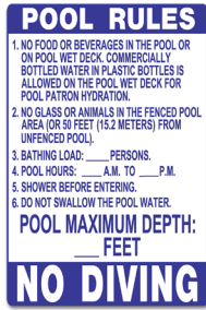
Pool Rules Sign ▶ 24" x 36"