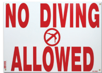
422020 No Diving Sign ▶ 12" x 18"