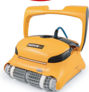
362126 WAVE 60 ROBOTIC POOL CLEANER